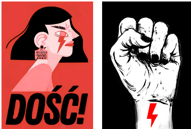
Figure 10. (left) Joanna Gębal, DOŚĆ! [Enough!], 2020.

The objectification, or more precisely, brutal commodification of women in the political discourse is also the subject of a poster by Joanna Gębal (b. 1989), an illustrator and designer based in Warsaw, and a graduate of the Academy of Fine Arts in Warsaw. The poster by Gębal (Figure 10) shows a brunette with short hair, tightened lips, and the thunderbolt emblem on her face; she is wearing an earring with a bar code, exactly the same as is attached to the ears of cows. The image is topped with a caption written with a sweeping black line: “Dość!” (“Enough!”).