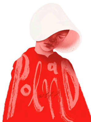
Figure 9. (right) Patrycja Podkościelny, Poland, wtf? , 2020.