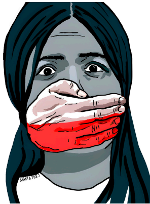
Figure 13. Marta Frej, Untitled, 2020.

with her mouth covered by a strong, apparently male hand. What is characteristic is that the hand is painted in white and red, the colours of the Polish flag (Figure 13). This work corresponds well to the motif of obscuring and shutting out , which I have already mentioned when writing about inspirations from the screen adaptation of Atwood’s novel. However, this type of image that presents femininity in the context of victimisation is rather exceptional amongst the numerous works created for the Women’s Strike in 2020. More often, we see here symbols of power, warning signs, thunderbolts, and clenched fists, responding to the actions of the government.