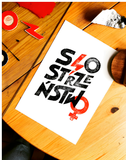
Figure 16. Kasia Piątek. A linocut poster prepared for the protest, to be printed out and shared (with the inscription: Siostrzeństwo/Sisterhood ), 2020. (source: https://kasiapiatek.pl/womens-strike-sisterhood-poster )