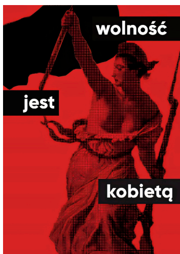
Figure 5. Joanna Musiał. Wolność jest kobietą [Freedom is a Woman], 2020.

a sexual object, and it is our decision what we do with it” (after: Szczerbiak et al., 2020, p. 89).