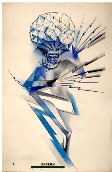
Figure 15. Zofia Stryjeńska, Perkun (from a Slavic deities series), crayon, 1934. The National Museum in Warsaw.