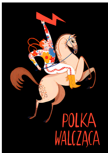
Figure 14. Ola Szmida, Polka walcząca [A Fighting Polish Woman], 2020.

Bożki słowiańskie (Slavic deities) in the collection of the National Museum in Warsaw. The body of Perkun, a god of storms and fertility from the pantheon of the Balts, forms a thunderbolt of light (Figure 15).